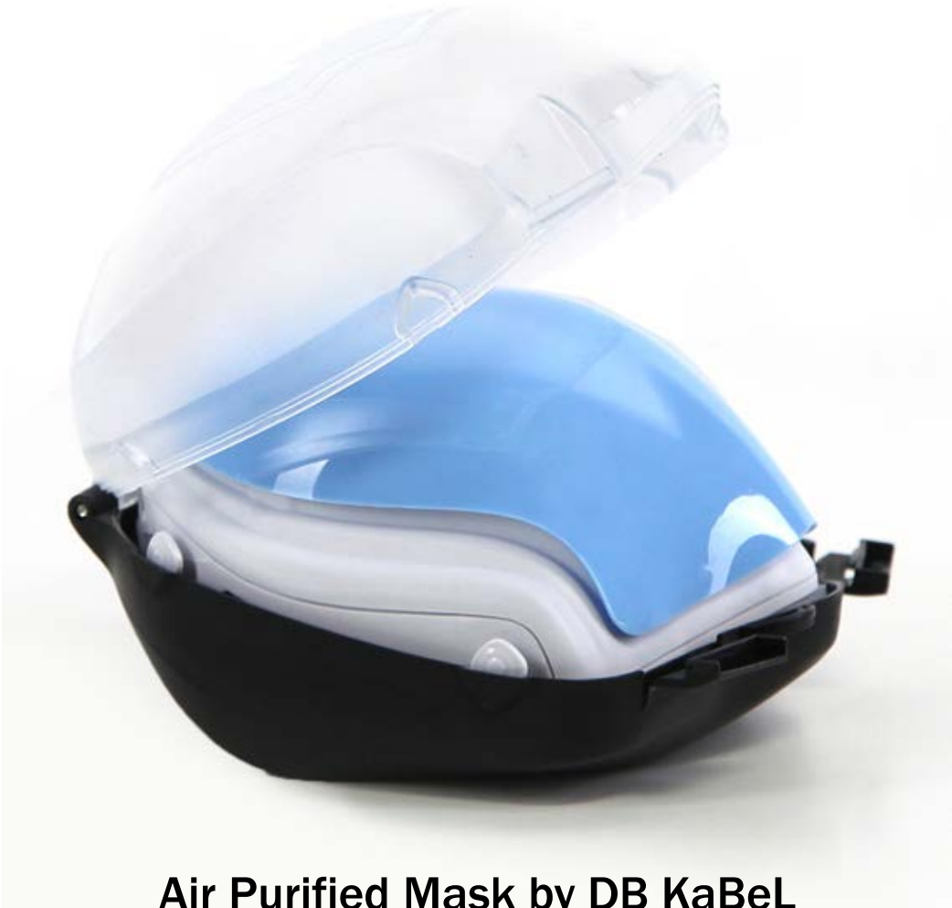
Air Purified Mask by DB KaBeL